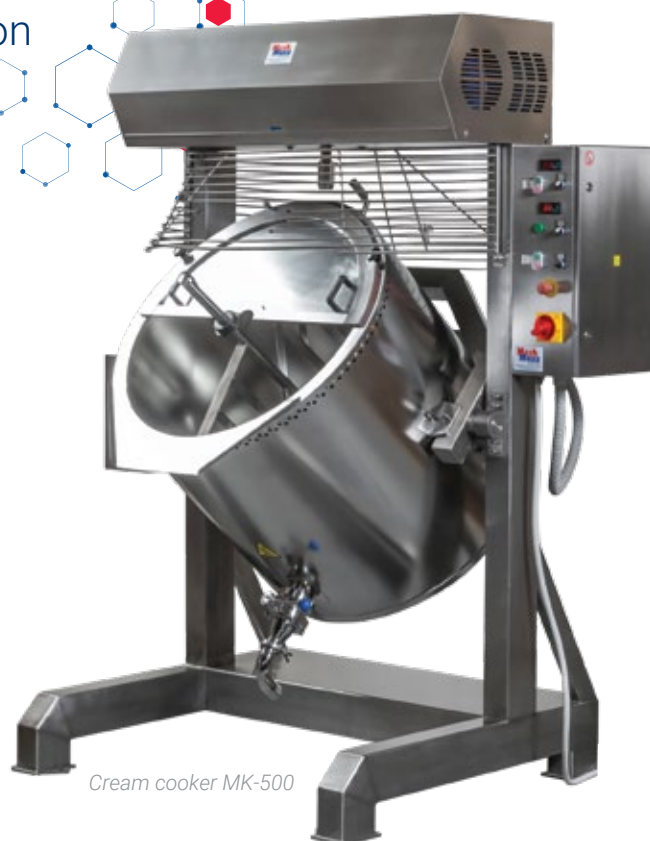
Cream cooker MK-500