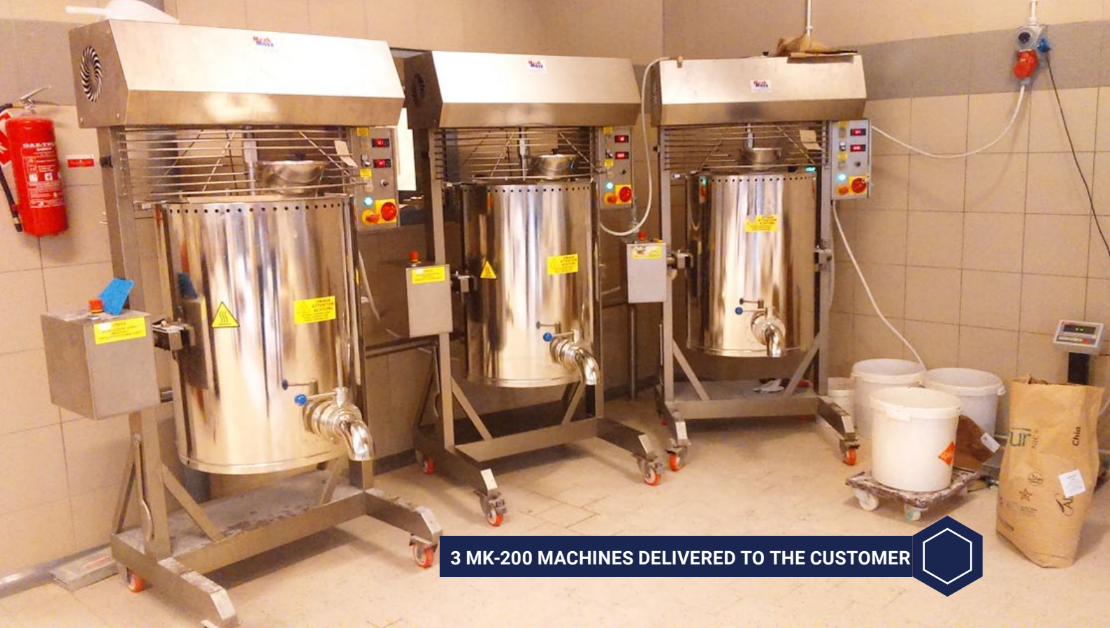
3 MK-200 MACHINES DELIVERED TO THE CUSTOMER